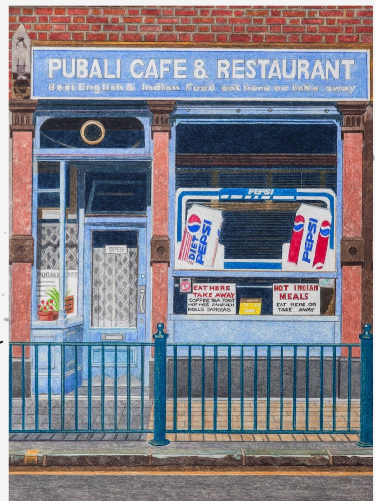
Doreen Fletcher, The Pubali Cafe, Commercial Road, Limehouse, East London, 1996