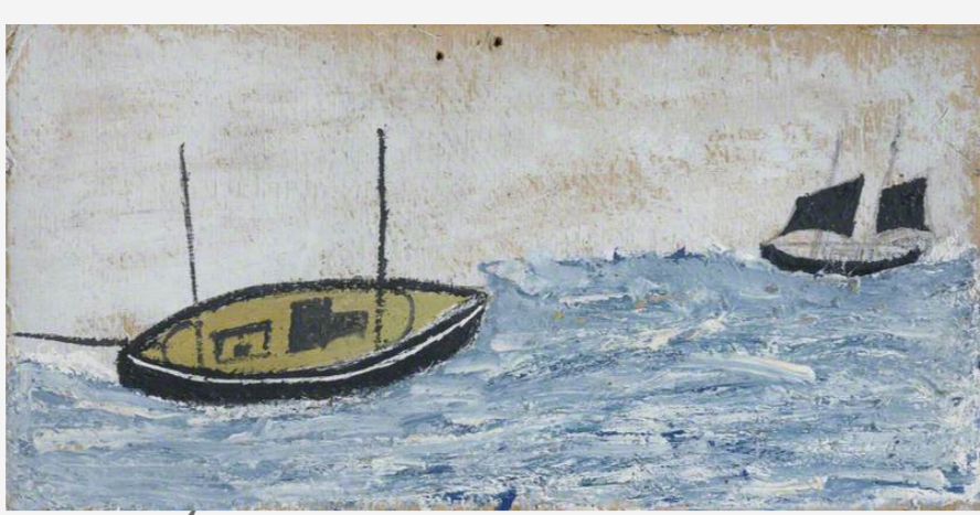
Alfred Walls, Two Boats, date unknown