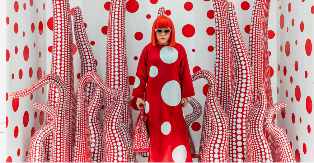
Yayoi Kusama, Louis Vuitton shop window display, 2012/2015