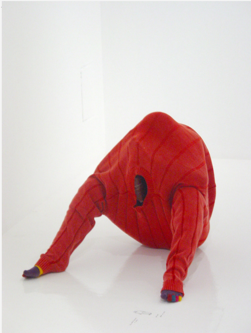
Erwin Wurm, Psycho I, 1996

neighbourhood, home, environment, context, frame, personal, cocoon, habitat, style, area