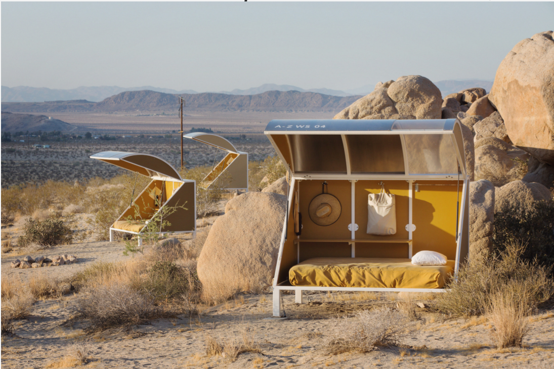
Andrea Zittel, A-Z West, 2000