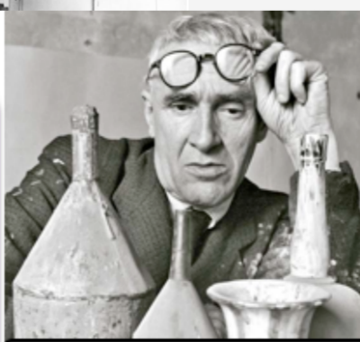
Giorgio Morandi in his studio, 1874

Task 1 Answer the following questions in full sentences. 1. Where did Morandi live his whole life? 2. Why did he choose to make his own paintings? 3. What was Morandi's primary subject matter? 4. Can you describe his use of colour?