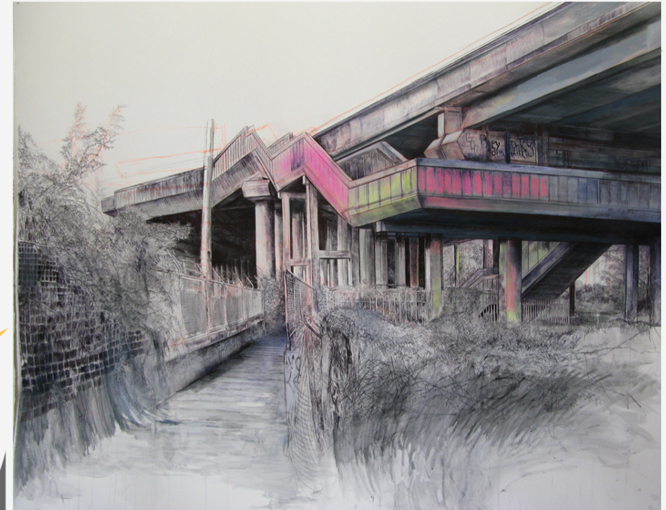
Laura Grace Ford Mb Junction 9, Bescot, 2011